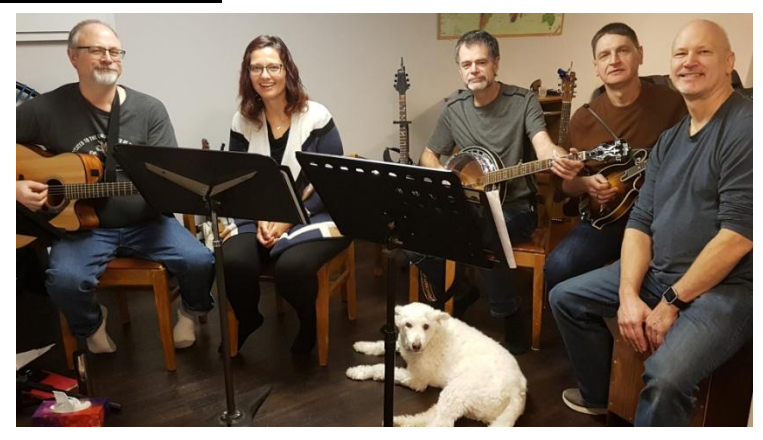
Deservedly So Song Book