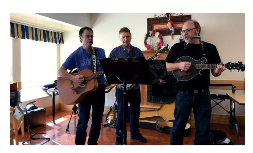
Deservedly So Song Book

Daisy, Daisy, Give me your answer do I'm half cra - zy all for the love of you It won't be a stylish marriage I can't afford a carriage But you'll look sweet Upon the seat Of a bicycle built for two