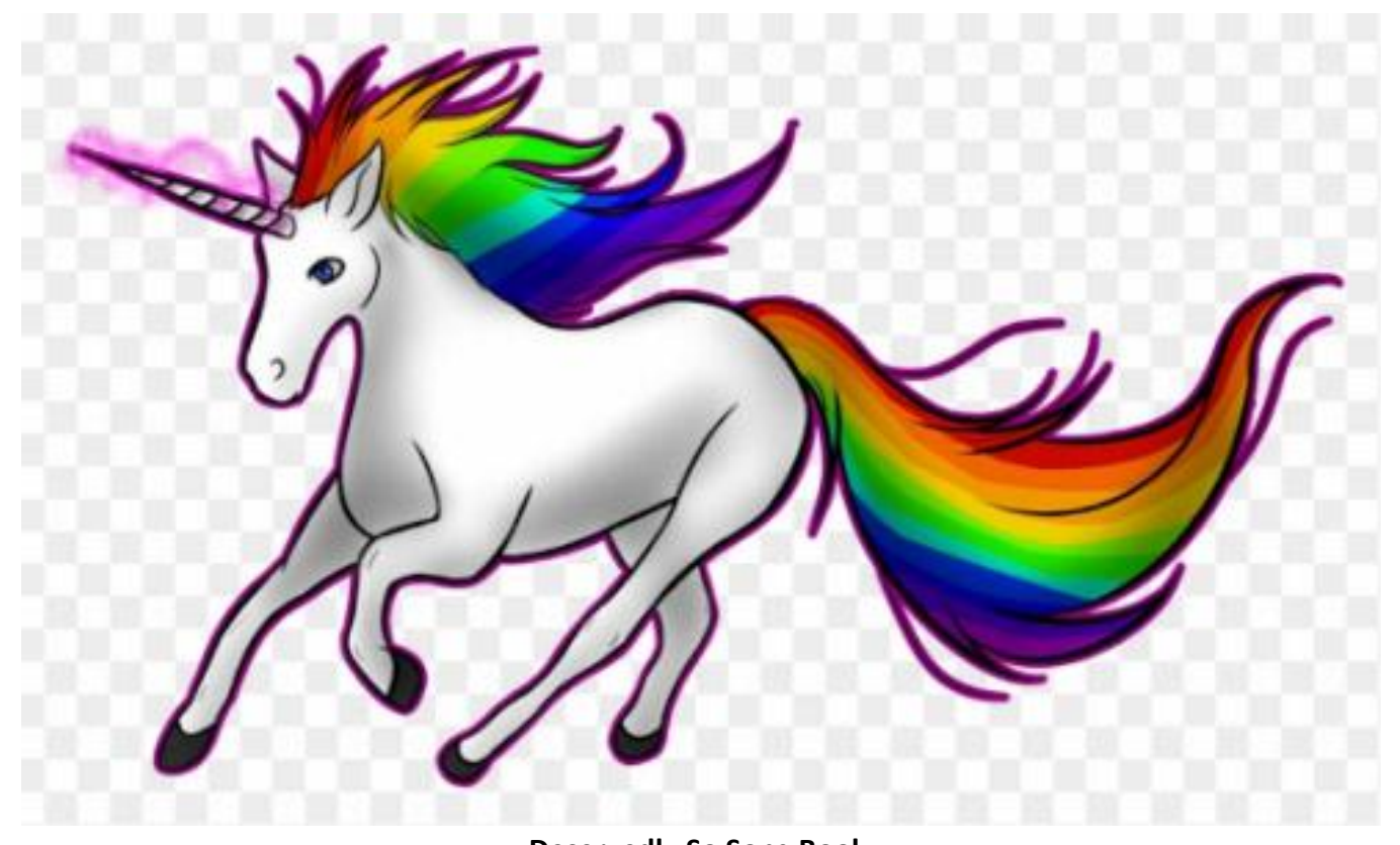
Deservedly So Song Book

You'll see green alligators and long - necked geese, some humpy back camels and some chimpanzees, Some cats and rats and elephants, but sure as you're born, you're never gonna see no u...ni...corns.